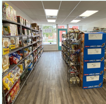
The 512 Food Pantry allows clients to choose the nutritional items they most need.

Our Thrift Store offers a wide variety of clothing, household items, and furniture for sale to the general public. When you shop at our Thrift Store, all sales cycle directly back into the Mission for direct service and outreach to the Giles community.